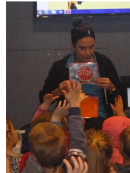
We learnt about signs.

We sang about needing to put on a seat belt when we get into our car. We learnt what a zebra crossing looks like. We talked about the signs that tell us about safe and unsafe places to swim at the beach. We talked about only ever taking medicine when it is given to us by an adult who cares for us.